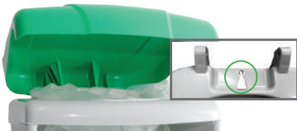
Lid override mechanism