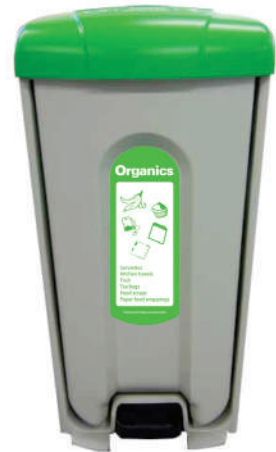
Solid liner model