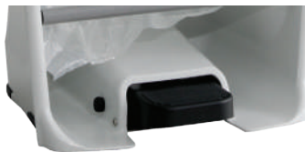
Foot pedal operation