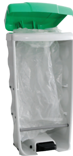
Sack retention model