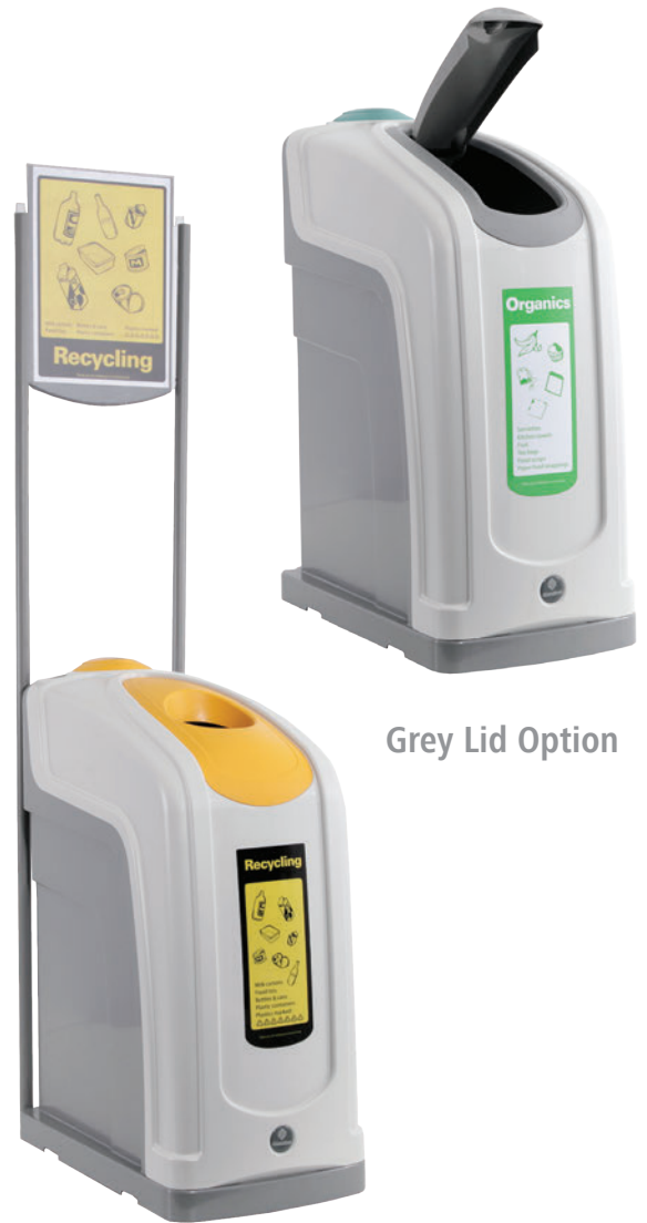
Grey Lid Option