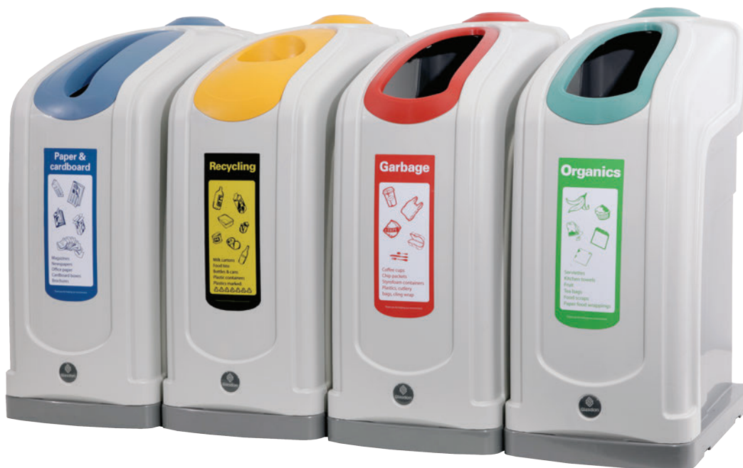
With signage kit